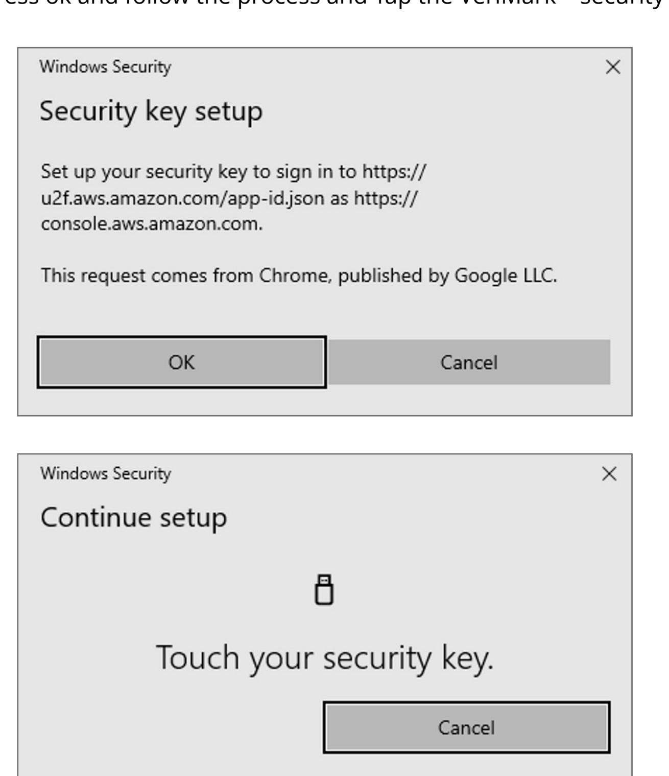
The VeriMark™ security key is ready for use with AWS. The next time you use your root user credentials to sign in, you must tap your VeriMark™ security key to complete the sign-in process